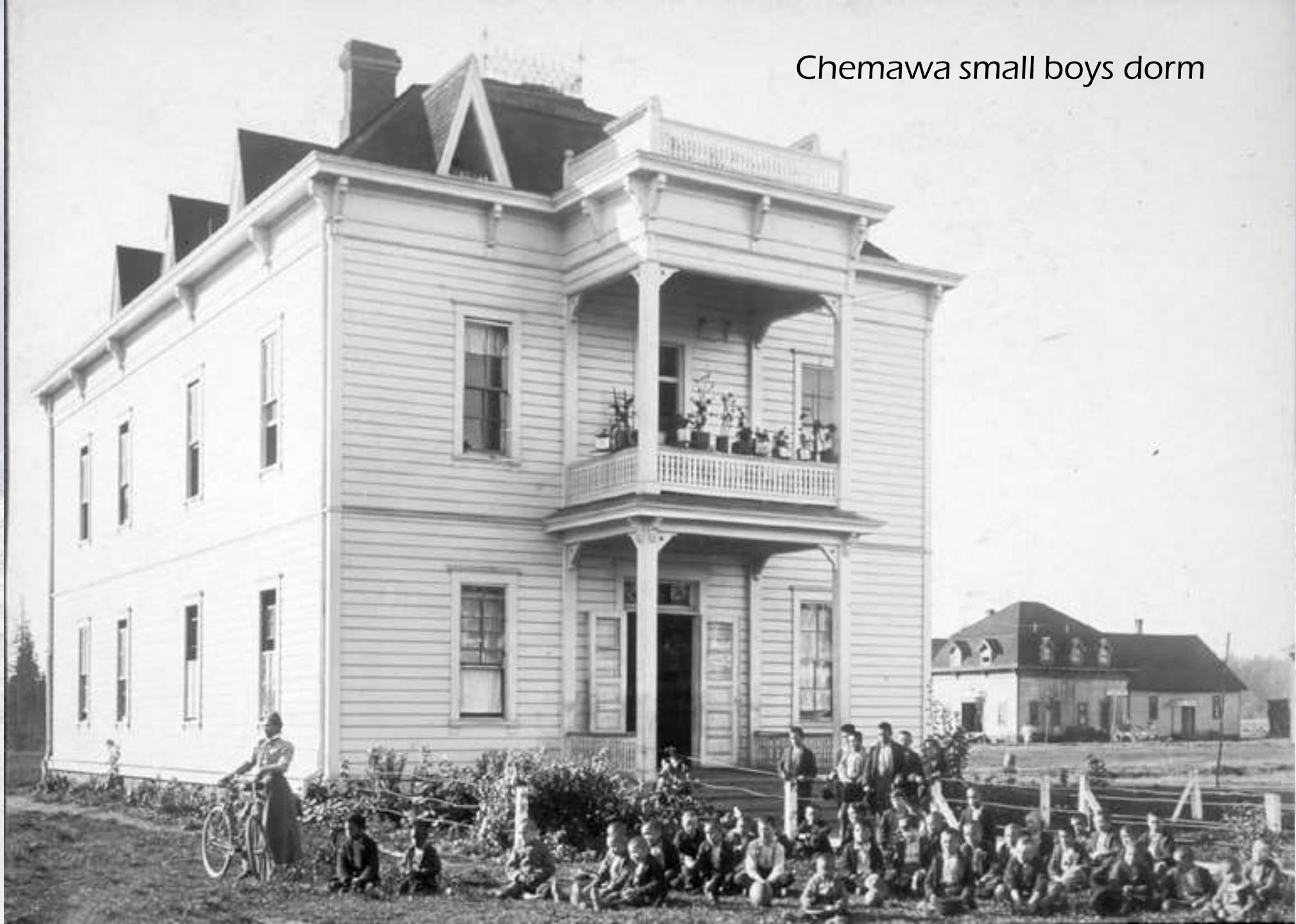
Chemawa small boys dorm