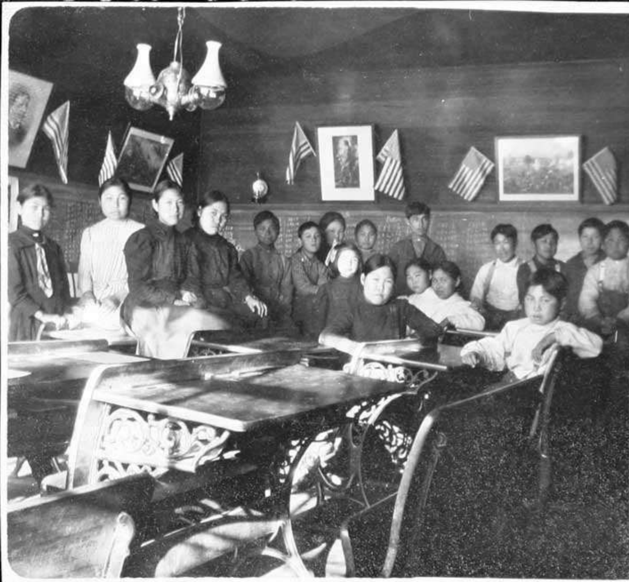
Native school at Golovin