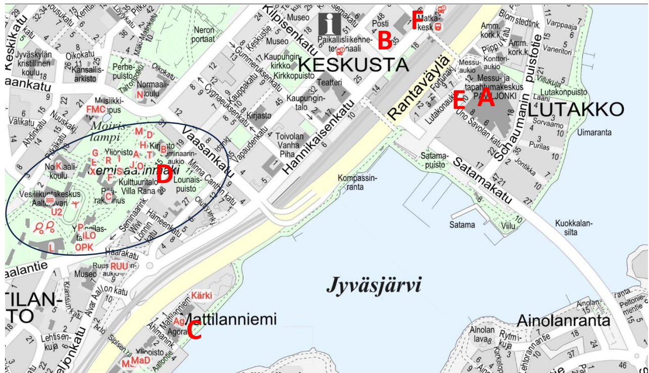
Map 1. Jyväskylä centre

A = Sokos Hotel Paviljonki (Lutakonaukio 10, 40100 Jyväskylä)