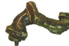
Eldre romertid (0-200) (60)