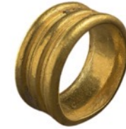
Yngre romertid (200-400) (30)