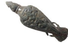
Merovingertid (550-793) (251)