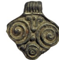
Yngre jernalder (550-1066) (958)