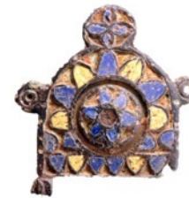
Eldre jernalder (500 f.Kr-550 e.Kr) (291)