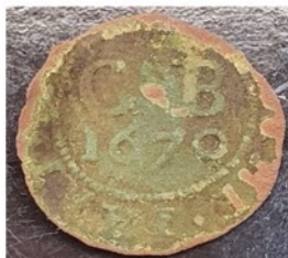
Bath 1670 farthing