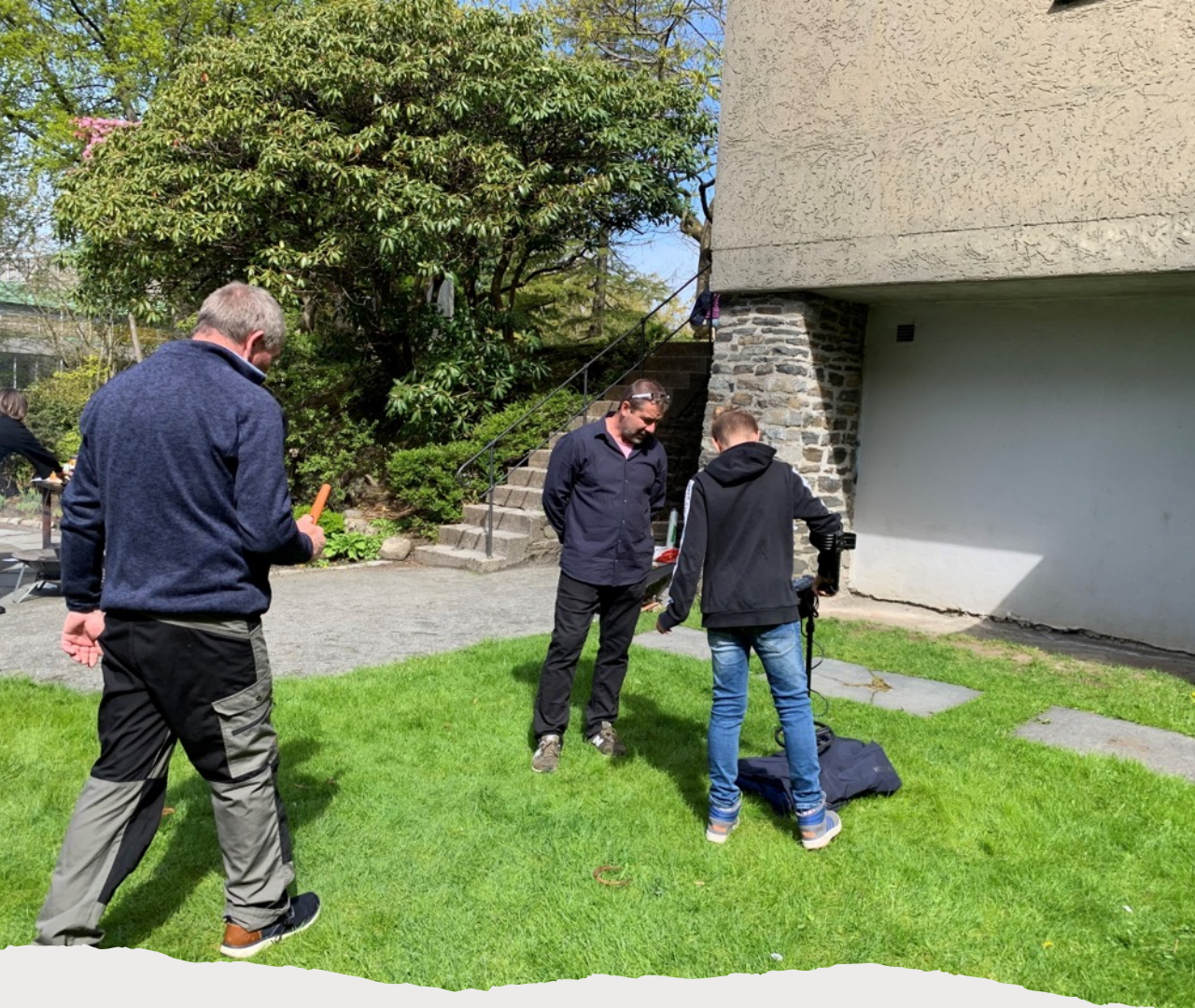
Archaeology Day at the Museum, 8 th May 2022