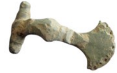
Folkevandringstid (400-550) (189)