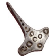
Vikingtid (793-1066) (708)