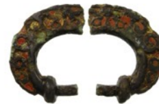
Før-romersk jernalder (500 f.Kr-0) (9)