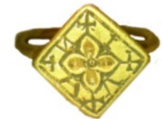
Middelalder (1066-1537) (590)