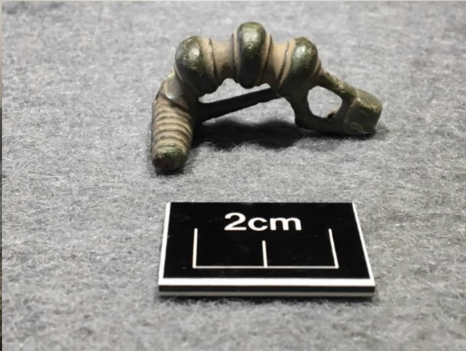
Wellpreserved fibula, short time in the plough layer.