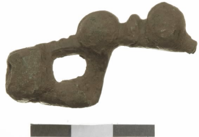
Degraded fibula, longer time in the plough layer.