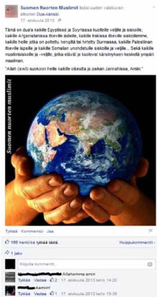
Figure 1. A typical dua update.