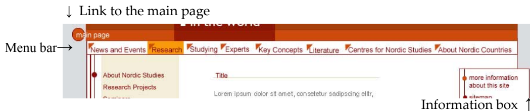
Figure 2 : Common features on each page

All the sections, except for the News and Events section, will have a sidebar in addition to the main menu bar. This sidebar will include the main titles inside the section, in other words the titles of the subsections. The first title is the one whose content is already open when entering to this section. The others function as links to the subsections. A red dot on the left side of the title marks the currently open section.