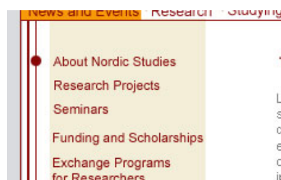
Figure 3 : Sidebar

All the sections, except for the News and Events section, will have a sidebar in addition to the main menu bar. This sidebar will include the main titles inside the section, in other words the titles of the subsections. The first title is the one whose content is already open when entering to this section. The others function as links to the subsections. A red dot on the left side of the title marks the currently open section.