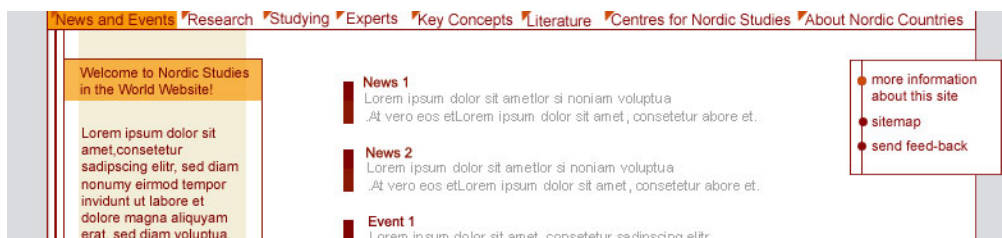
Figure 4 : Links on the section News and Events

The "News and Events" section will not have any specific subsections for the simple reason that this section hasn't got any permanent content: current news and events are changing constantly. In this section all the titles (The names of events, seminars and so on) with a short, two lines introduction to the theme will be placed in the text field. These titles will also function as text links to the actual page where the description of the given event. At the News and Events section, which serves also as the main page of this site, the actual place of subsection's titles is occupied by a "welcome-box". This box contains a brief introduction about this site by answering such basic questions as "What is this site all about?" In the end of the introductory text there is a text link to the actual "more information about this site" which explains the functioning of this site in great detail.