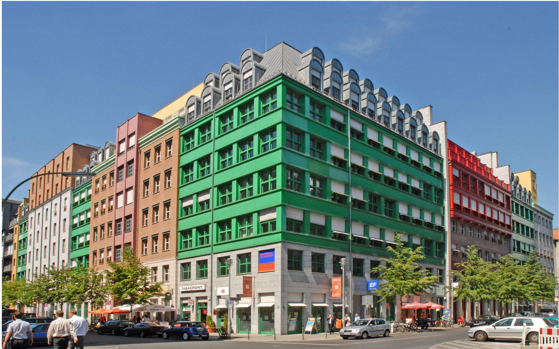
The „European City“ re-designed: new building(s) in Berlin, Schützenstraße by Aldo Rossi, 1995-97